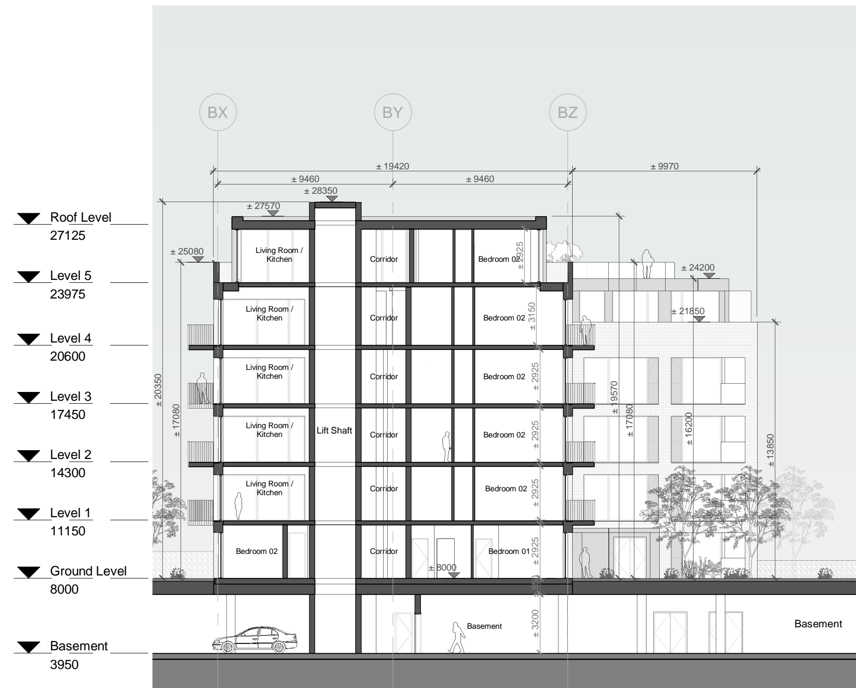
3 Building B - Section CC scale 1 : 200