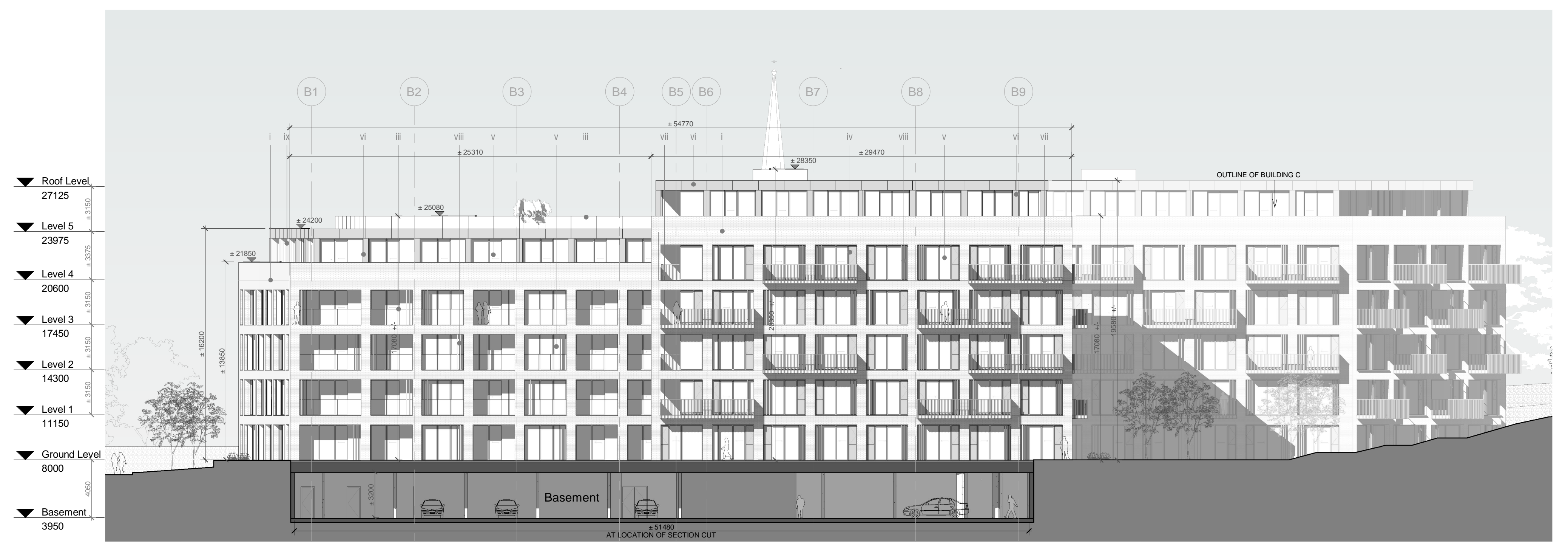
2 Building B - West Elevation scale 1 : 200