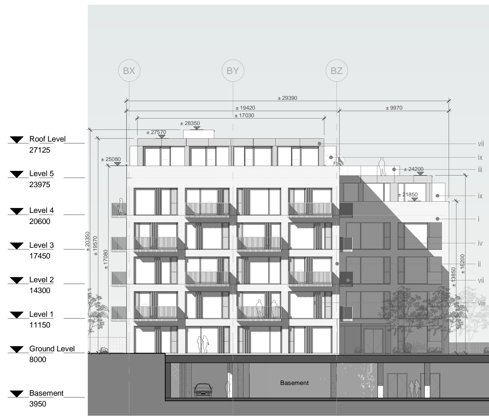
1 Building B - South Elevation scale 1 : 200